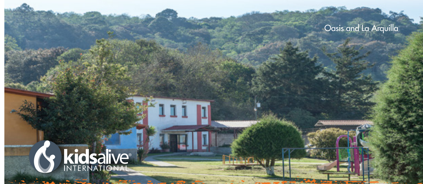
Oasis and La Arquilla

"Ask the Lord of the harvest, therefore, to send out workers into his harvest field." Matt. 9:38 (NIV)