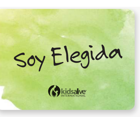
Life Declaration card #2: "I am Chosen"

Kids Alive believes personal Bible study is essential to holistic education, leading to an abundant life. One young adult recently learned this lesson.